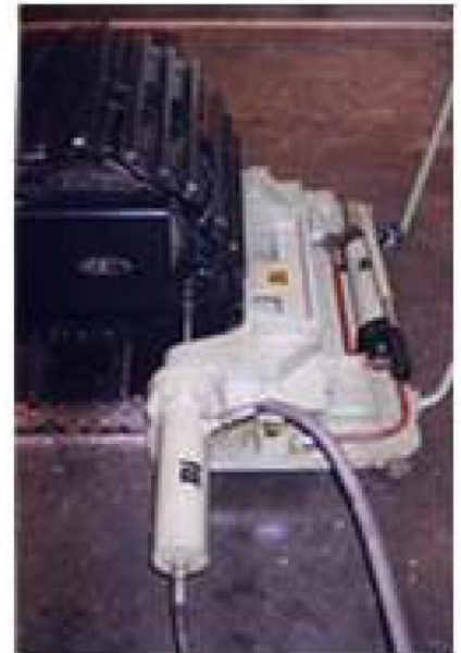
Track Link Press using LSP10 & FSP cylinder H001 pump C-Frame & power pack.

Series : TPP Capacity : 50,100 and 150 Tons